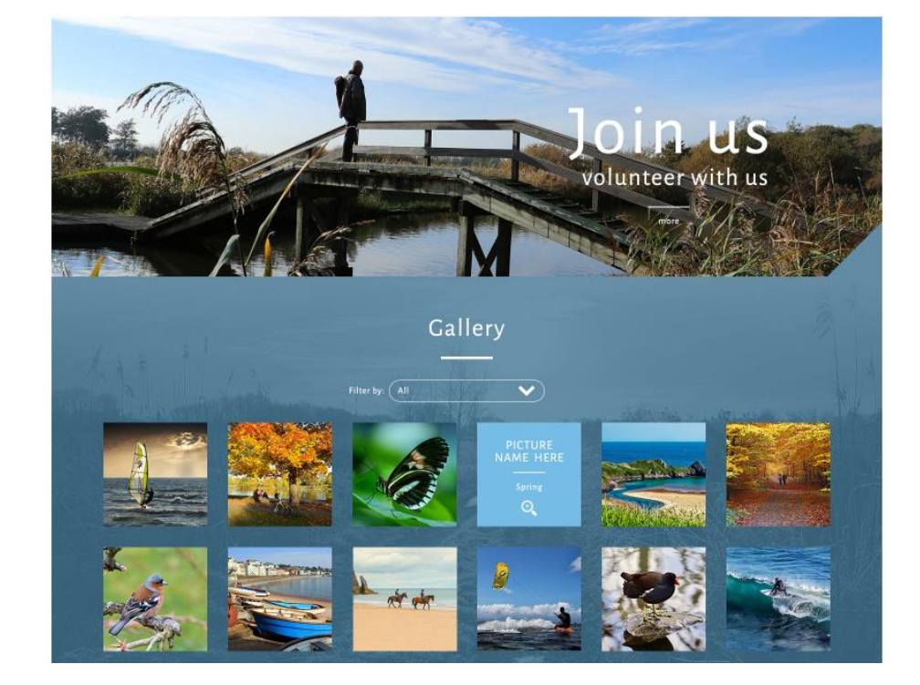
10 / 4 / 2021 - Pebblebed Heaths